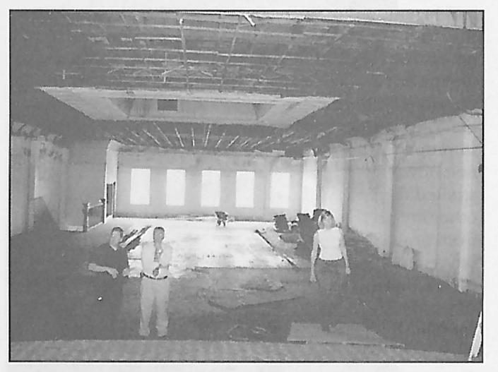
Noble County Public Library, Cromwell Branch stage area of the old "Smith Hall" built in 1910 before renovations