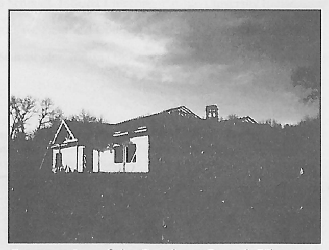
Construction of the Roselawn Branch Library in Newton County

The Oakland City-Columbia Township Public Library has received a $1,000 grant from Toyota Motor Manufacturing Indiana to support the "Story Times" program for 2006. The Montgomery County Community Foundation has awarded the Crawfordsville District Public Library and the Montgomery County Historical Society $10,000. The funds will be used to purchase exhibit cases, conservation supplies, and software in the renovation process of the library building, which will be known as the Carnegie Museum of Montgomery County. Steel Dynamics, Inc. has