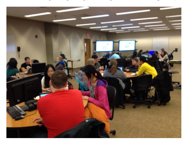
Figure 2- MGMT 175 Class in Session.

Data-driven decision-making is an important skill for business people who have to use many different types of information throughout their careers. The course has an explicitly problembased curriculum where students solve problems both individually and in groups on topics ranging from solar panels to chocolate to over-the-counter pharmaceuticals. The 70-student sections are taught by three business librarians' in an active learning classroom. Students sit in four to six person groups, with one desktop computer per table provided (see Figure 2).