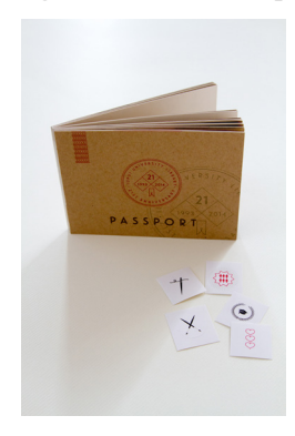
Figure 3 and 4: Passport from the event.

were exhibits. Some were even people whose name tags indicated what number story they represented. Guests took home two keepsakes, a completed passport of their own making and an anniversary Mason jar mug.