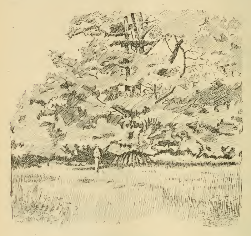
SKETCH FROM A PHOTOGRAPH.

In the vicinity of Goose Pond and Clear Pond a few old trees were standing in clear open spaces once covered by water, but dry and good pasture land in September of 1897. These old trees were of large diameter at the ground, one measuring 15 feet at the surface of the ground. This expanded trunk contracted suddenly into a bench at a height of about