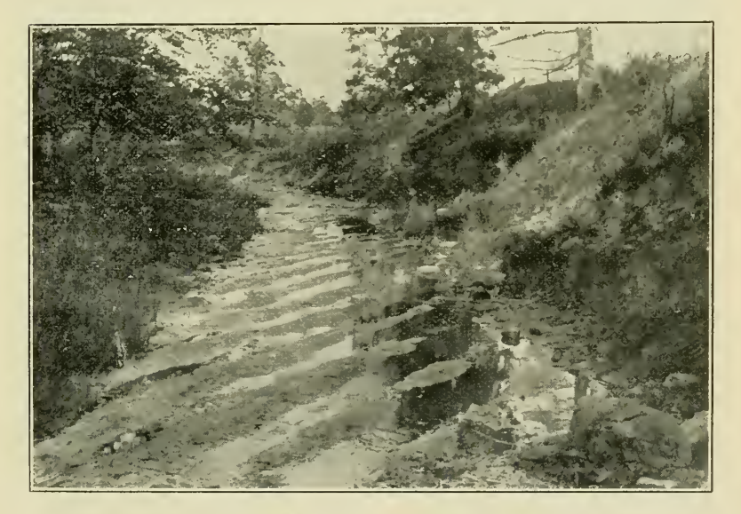
Ripple Marks -- Down-stream View.