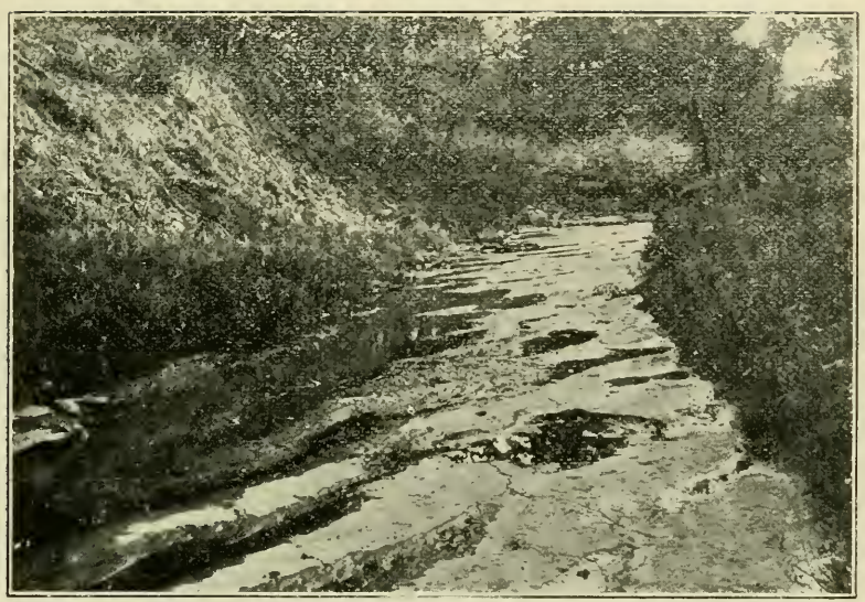
Ripple Marks—Up-stream View. PLATE II.