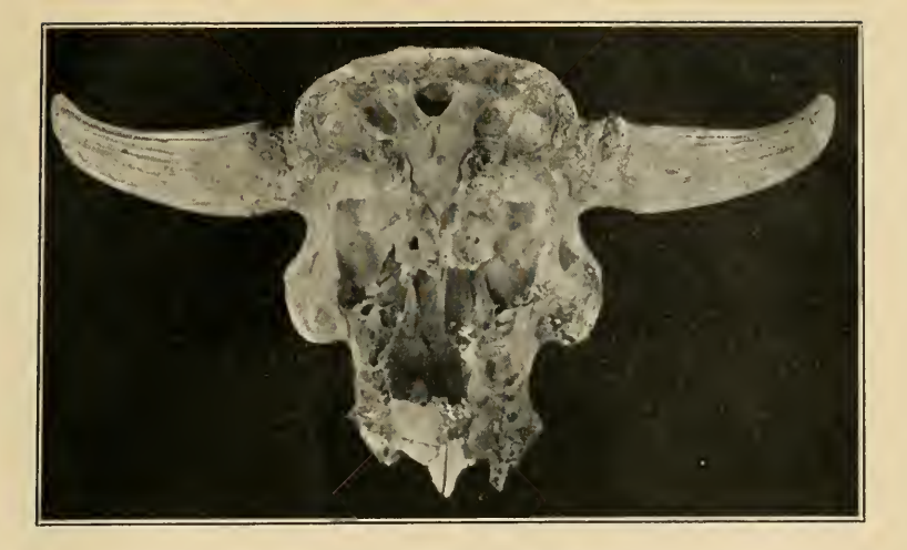
BASAL AND OCCIPITAL VIEW,