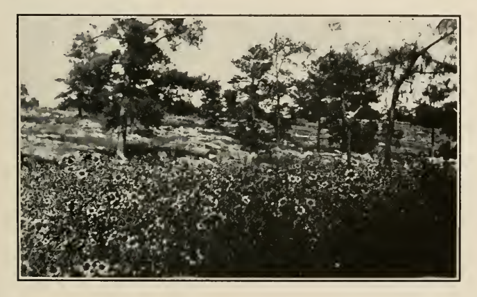
Fig. 9. A pure stand of Gymnolomia Porteri in full bloom, on the south side of Stone Mountain.

Fig. 2. A view on the northwest side of Stone Mountain. The almost bare slope is gradual and the somewhat broad talus supports a pure stand of broad leaf trees.