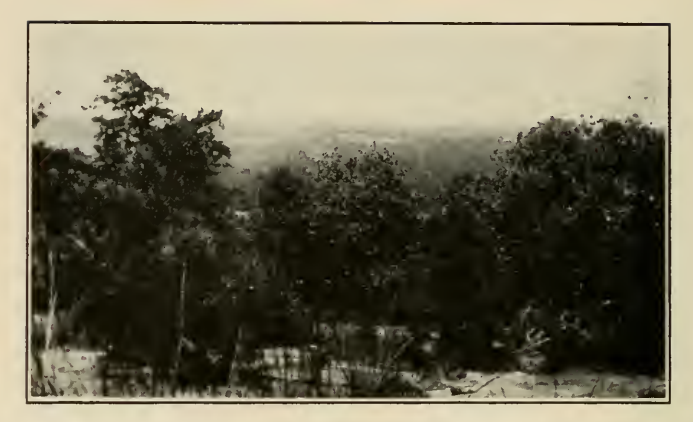
Fig. 6. Mixed forest on the west side of Stone Mountain.