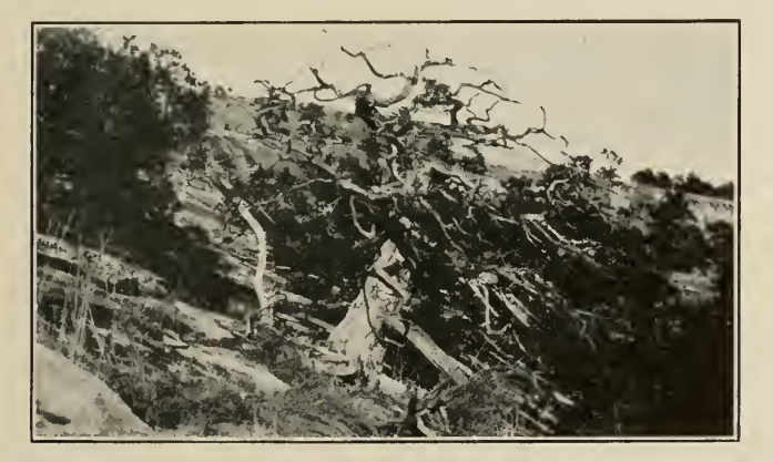
Fig. 3. A south side view near the crest where the tree growth is composed largely of red cedar and loblolly pine.

The vertical north side merges westward into a graded slope the surface of which becomes progressively less steep and more broken toward the west, and thence, on around to the south. On the eastern portion of this slope no flowering plants are found, except in depressions or around weathering fragments of granite. Further west, however, there is a meager forest associated with a limited number of herbaceous species (Fig. 8). The north talus broadens as it extends westward and for a considerable distance the tree formation is dense, composed purely of broad-leaved species (Fig. 2).