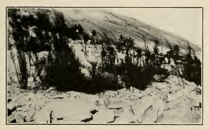
Fig. 10. Eupatorium capillifolium growing in the pure granite debris of the quarry on the southeast side of Stone Mountain.

The talus on the south is covered by a pure stand of Pinus Taeda. This pure stand grades inland into a mixed forest with a herbaceous flora more or less like that found in any broad leaf forest of the region. The herbaceous vegetation of the exposed areas on the south