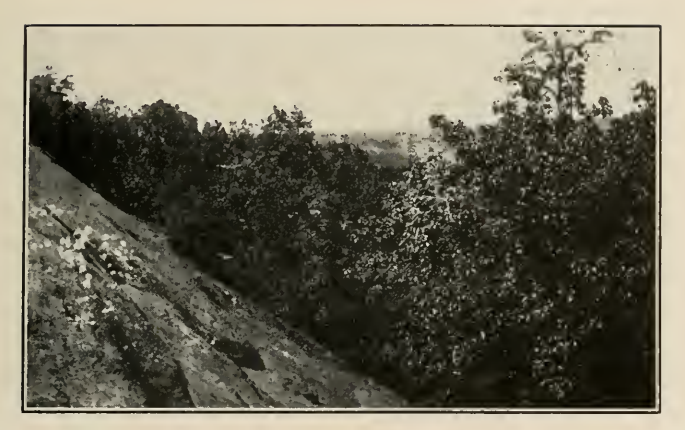
Fig. 2. A view on the northwest side of Stone Mountain. The almost bare slope is gradual and the somewhat broad talus supports a pure stand of broad leaf trees.