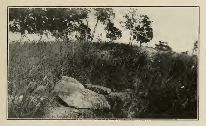
Fig. 8. A pure stand of Andropogon virginiana on the northwest side of Stone Mountain and dwarfed red cedar in the background.

The vertical north side merges westward into a graded slope the surface of which becomes progressively less steep and more broken toward the west, and thence, on around to the south. On the eastern portion of this slope no flowering plants are found, except in depressions or around weathering fragments of granite. Further west, however, there is a meager forest associated with a limited number of herbaceous species (Fig. 8). The north talus broadens as it extends westward and for a considerable distance the tree formation is dense, composed purely of broad-leaved species (Fig. 2).