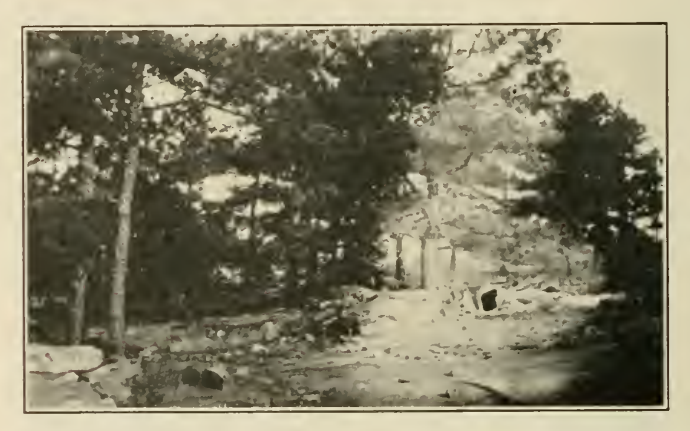
Fig. 5. A pure stand of pine at a high elevation on the south side.

Fig. 4. A view about half way to the summit on the south side of Stone Mountain. showing the broken surface and the uneven distribution of the vegetation. Broom-sedge (Andropogon virginiana) in one of the few cracks of the mountain.