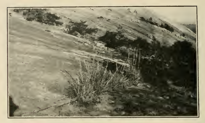
Fig. 4. A view about half way to the summit on the south side of Stone Mountain. showing the broken surface and the uneven distribution of the vegetation. Broom-sedge (Andropogon virginiana) in one of the few cracks of the mountain.