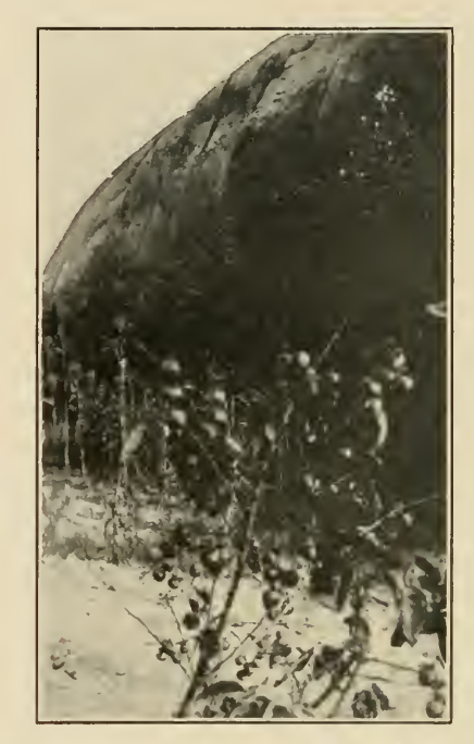
Fig. 1. A view of the steep bare north side of Stone Mountain and the pure broad leaf forest on the narrow talus at the base.