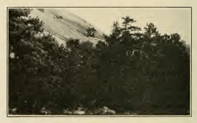
Fig. 7. A mixed forest southeast of Stone Mountain.

growing. One might fancy these as the ravines on the north side of Stone Mountain that a million years or more have wrought.