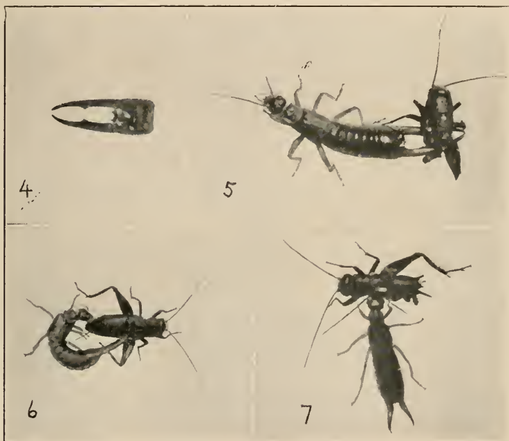
Fig. 4. The forceps of a male. All that was left of a victim of cannibalism.

With the exception of the most pugnacious the males are very timid and are the first to scamper away when disturbed. The young males are especially timid and apparently stay in hiding most of the time. This probably accounts for the few very young males collected. Most of the older males were battle scarred and it was seldom that a specimen did