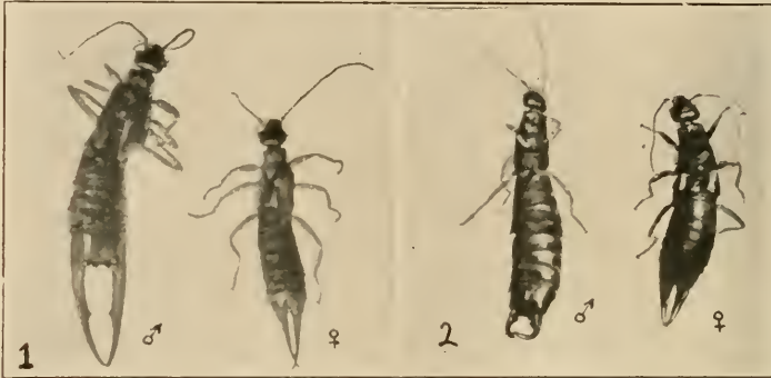
Figs. 1-2. Mounted specimens of the two types of earwigs used in the experiments. Note the powerful forceps. Slightly enlarged.

When disturbed the earwigs often raise their forceps in a threatening manner that reminds one of the scorpions. This position seems to