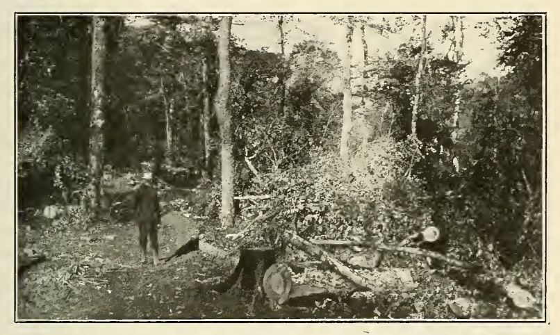
5. Stumpage and slash which will invite forest fires in the Southern Appalachian Highlands.

A few years ago Berea College, with the help of the United States government, employed a special investigator and demonstrator to work with the mountain farmers within reach of Berea. The success was such that a number have been appointed in other localities. About Berea, heavy breaking plows are replacing the one-mule plow, and the disk harrow is pushing back into the mountains. More than twice as many shallow culti-