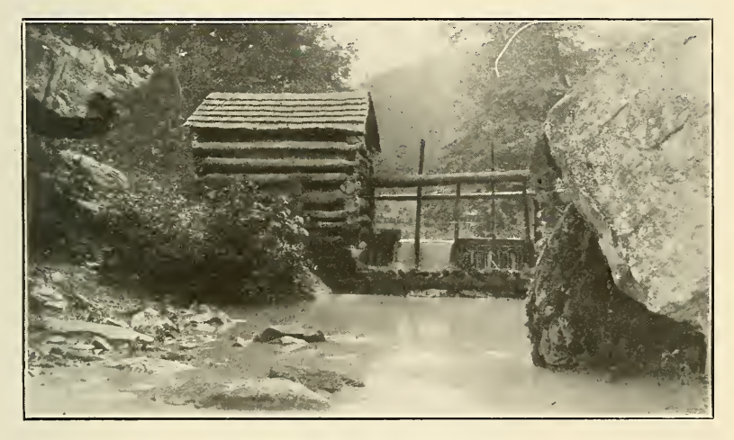
6. A primitive mill, near Cornettsville, Ky.

Transportation is the basic problem of the region. Poor communication within it has influenced greatly every phase of life always, and bad connections with the outside have isolated the country since 1850.