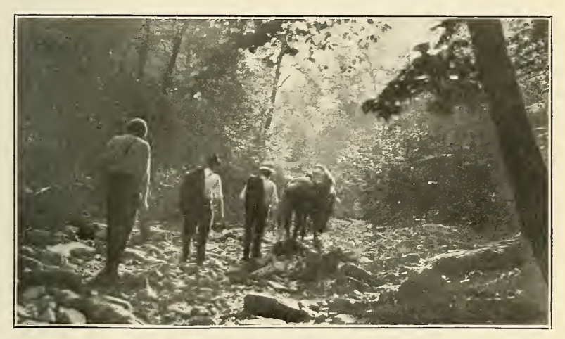
2. An example of the poorest highways in the mountains, near Pine Mountain Postoffice, Ky.

Between 1800 and 1840 the mountain region was an integral part of the State, for various reasons. Four interstate, transmontaine routes trav-