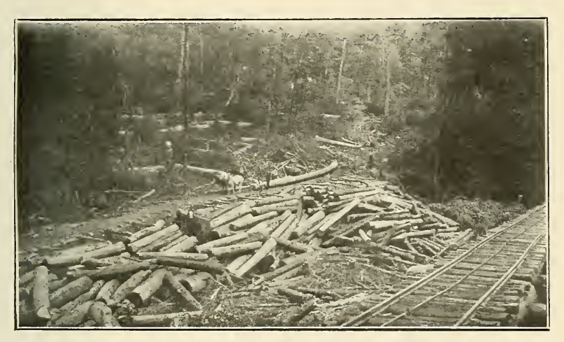
4. Snaking logs in the Southern Appalachian Highlands.

A passing forest industry is the digging of ginseng and other roots. The normal market price for the first is five dollars to seven dollars per