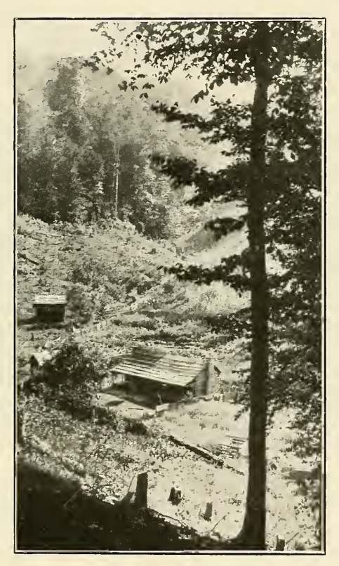
3. A primitive mountain home, near Buckhorn, Ky.

The first extensive exploitation began in the region about Middlesboro, in 1892. At present most of this coal is shipped south. Some two years