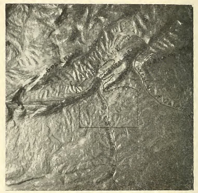
Fig. 1. Relief Map of the Hot Springs Area.

This valley is from a mile to a mile and a quarter in width. About two miles northeast of the hot springs, where West Branch of Gulpha Creek cuts through North Mountain, is a limited area with an elevation of about 620 feet. The greater part of the surface, however, stands above the 700-foot contour, and the highest hills exceed 800 feet. The highest elevation at which any of the springs emerge is about 640 feet.