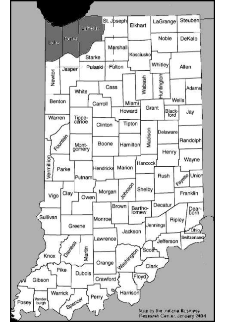
Figure 1.—Indiana map with Lake, Porter and LaPorte Counties, Northern Indiana colored grey. Map by the Indiana Business Research Center, January 2004 http://www.stats.indiana.edu/.

Animals.—A total of 332 bats were collected from throughout Indiana by the public between September 2005 and December 2007. Bats were submitted to the Indiana State Department of Health rabies laboratory for rabies testing and found non-rabid. Brains were removed and a portion of each brain was used for rabies testing. The remaining brain was kept for cholinesterase (ChE) bioassays. Non-rabid bats (stored in Ziploc<sup>®</sup> bags) and brains from non-rabid bats