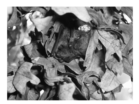
Figure 2.—Eastern Pipistrelle A6151 roosting with another untagged Eastern Pipistrelle in a cluster of dead oak leaves about 2.5 m off the ground.

relatively long staging periods following emergence from hibernation and prior to entering leaf clusters. During this time they may form small temporary colonies (prematernity colonies) in or on buildings prior to moving to the