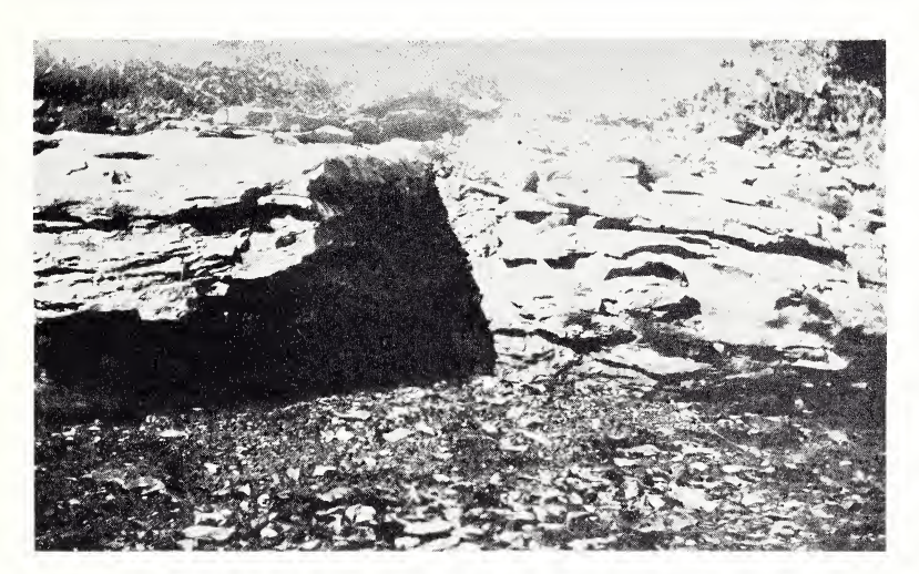
Fig. 2. Brecciated zone in bank of Bryant's Creek, cast edge of Sec. 12, T10N, R1W, Washington Township.

The above described section is the only one in which the actual fracture zone between Harrodsburg and Borden is visible, but in the southeast quarter of Section 1, Washington Township, the location can be determined to within about 100 feet. A gully extends south from a secondary road, one-eighth mile southeast of State Road 37. The base of the Harrodsburg here is at 795 feet. Two hundred feet to the east, a second gully has been formed. Massive sandstone is exposed on the slopes leading to this latter ravine, at an elevation of at least 840 feet. Thus the fault is between the two ravines, trending in a north-northwesterly direction.