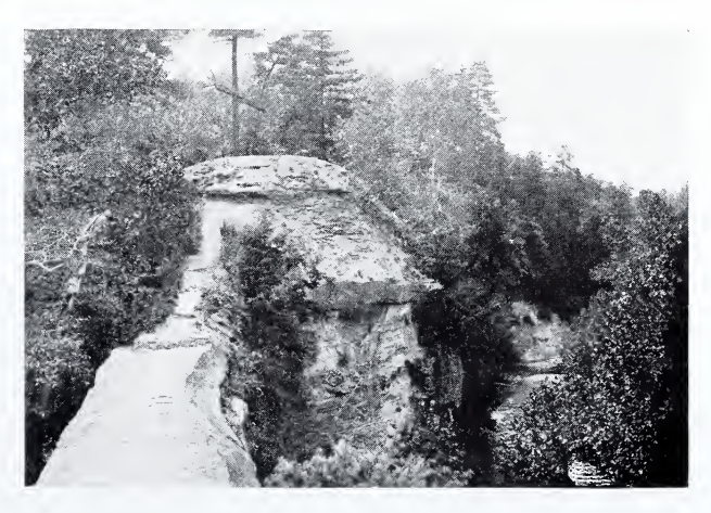
Fig. 7. <sup>1</sup> Cumings: Bull. G. S. A., Vol. 43, p. 331, 1932.

Zone 2. The most interesting strata in Zone 2 are the highly fossiliferous, usually crystalline coquinas interbedded in the sandstones (biostromes of Cumings'). They are widespread throughout the park and are the springmakers in the park. Such springs are found where the path crosses Hardscrabble Gulch, on Camp Brook, on Spring Cliff and