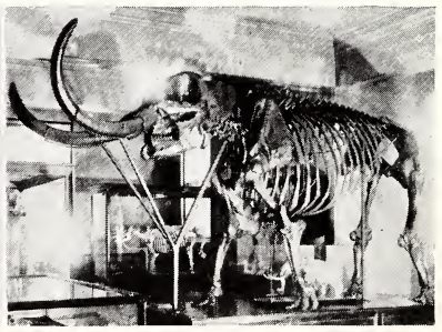
Fig. 4. DeKalb County; Carnegie Museum, Pittsburgh.