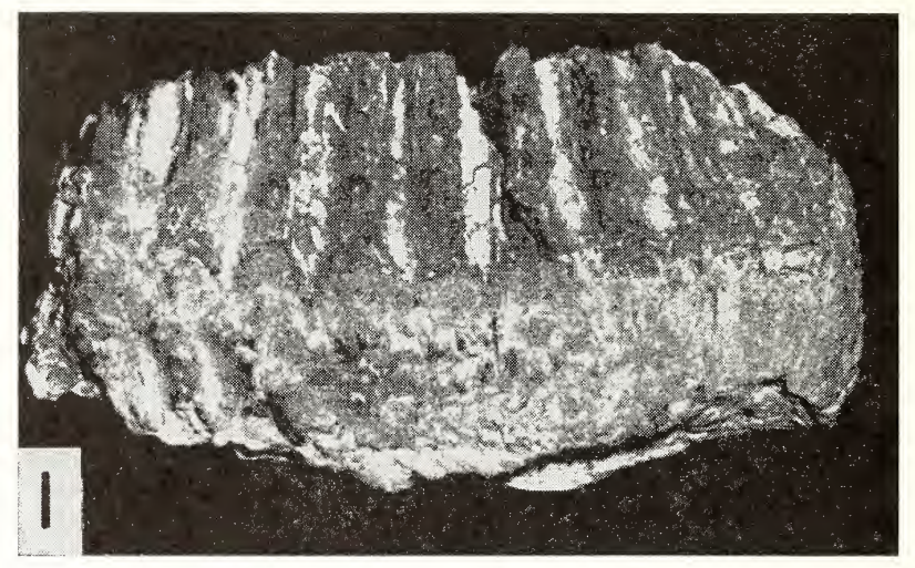
Figure 1. Large tooth in side view with crown uppermost, root below. From root-crown junction the sides of seven ridge plates are visible as darker columns between lighter layers of cement. Photograph, X 0.6 approximately.

downward only 45 mm from the root-crown junction, and the root was 180 mm in antero-posterior greatest length. From its top or grindingsurface aspect (Fig. 2), the tooth exhibited a straighter side 170 mm long and a more curved side 150 mm in antero-posterior length, both measured at mid-crown height. Crown height was determined by averaging the heights of the separate ridge plates; this mean height was 54.5 mm on the curved (convex) side, 53.6 mm on the straighter side.