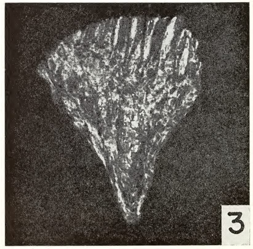
Figure 3. Small tooth in side view. Note progressive decrease in height of ridge plates from right to left. Photograph, X 0.65 approximately.

This smaller tooth, weighing 0.5 Kg, was relatively more complete than the larger one described above. The grinding surface was ovoid in shape, and had a transverse dimension (greatest width) of 68.2 mm. Viewed from the side, the tooth was approximately triangular in shape