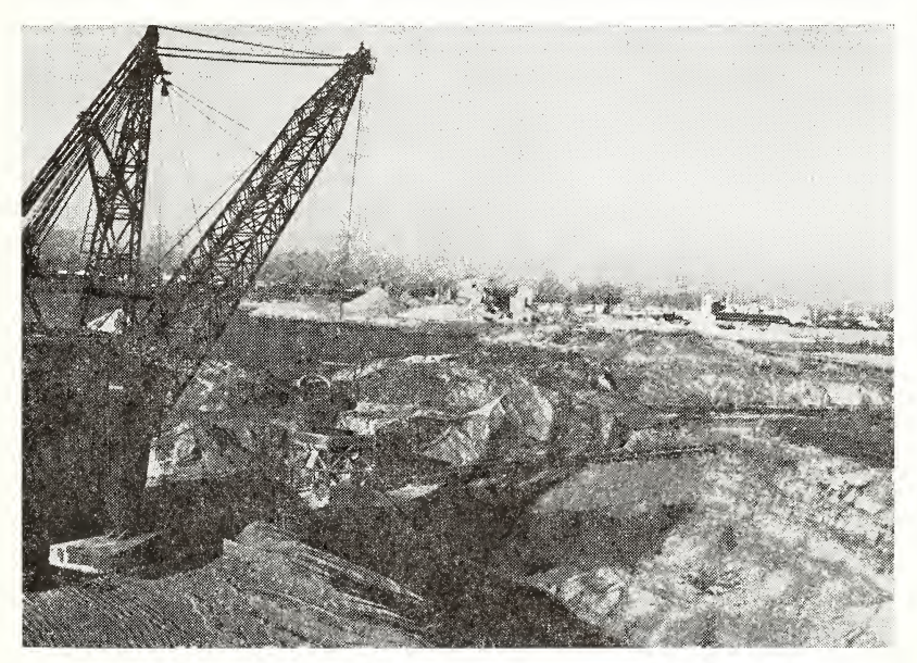
Figure 1. Gravel pit in suburban area of Indianapolis (13, pl 5A) where operation is almost completely surrounded by urban land uses. A workedout part of the pit not visible in this photograph has been reclaimed for recreational uses.

Mineral resources that are used extensively in construction, such as sand, gravel, and crushed stone, must be exploited close to their markets (Fig. 1). These resources have a large bulk and low value per ton and are generally surface mined. Maintenance of a high quality supply at a low delivered price is important to the growth of every expanding urban area. To keep construction costs low haulage distances for aggregates must be short, because much of the final delivered price is the cost of hauling (9, 24, 25).