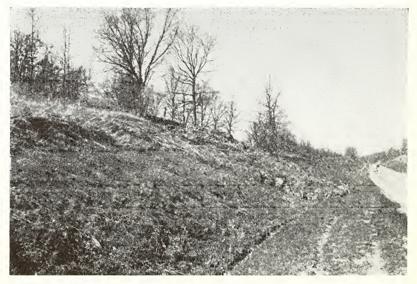
Figure 3. Mudflow on road cut in weathered Illinoian till along State Road 37 near Morgan-Monroe county line. The high clay content of the weathered till prevented it from remaining stable at the original cut dimensions, although a similar cut in unweathered till probably would have remained stable at that slope.

Not all land underlain by sensitive materials is on slopes, however. Areas underlain by muck, peat, marl, and other soft sediments that ac-