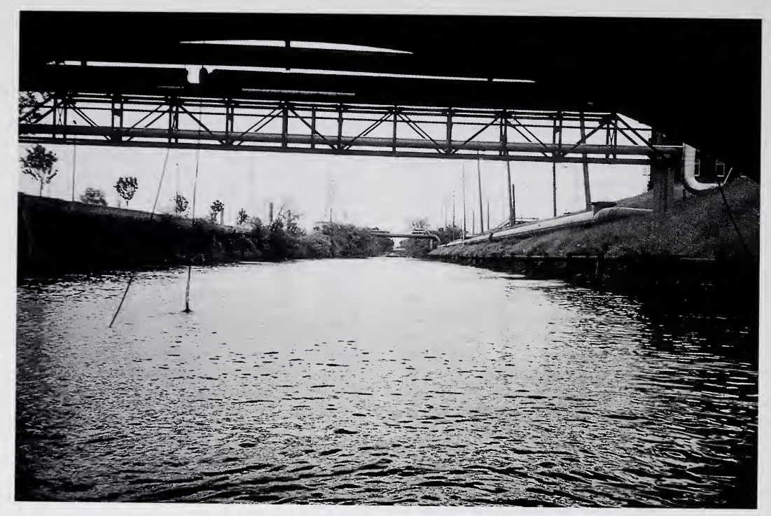
In addition to transportation crossings, the areas around the Grand Calumet River are heavily used by industry. Pipelines run along much of its length and across the channel. The banks have been heavily modified in order to maintain industrial equipment.