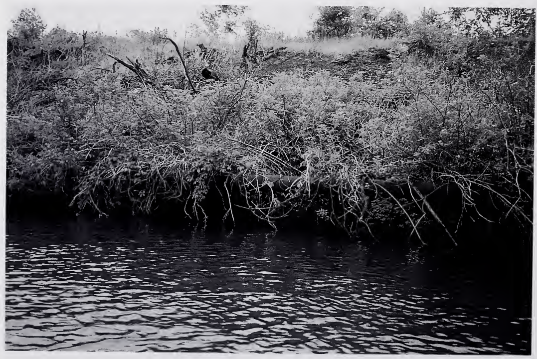
Gradually sloping banks have been sharply inclined along much of the river where the bank has been cut back to widen the channel and protect industrial pipelines. This greatly impacts drainage and natural vegetation.