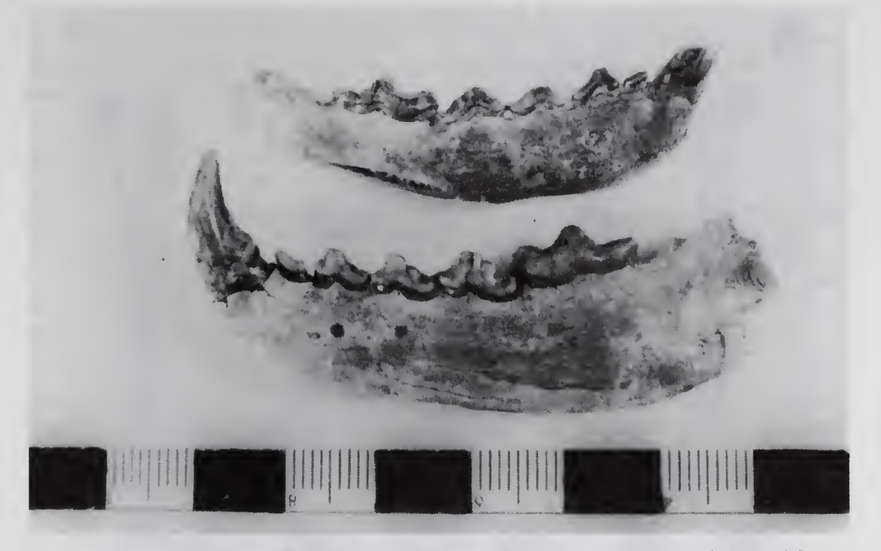
FIGURE 2. Left male (below) and right female dentaries of the fisher ( Martes pennanti ), Megenity Peccary Cave, Crawford County, Indiana. Scale in millimeters and centimeters.