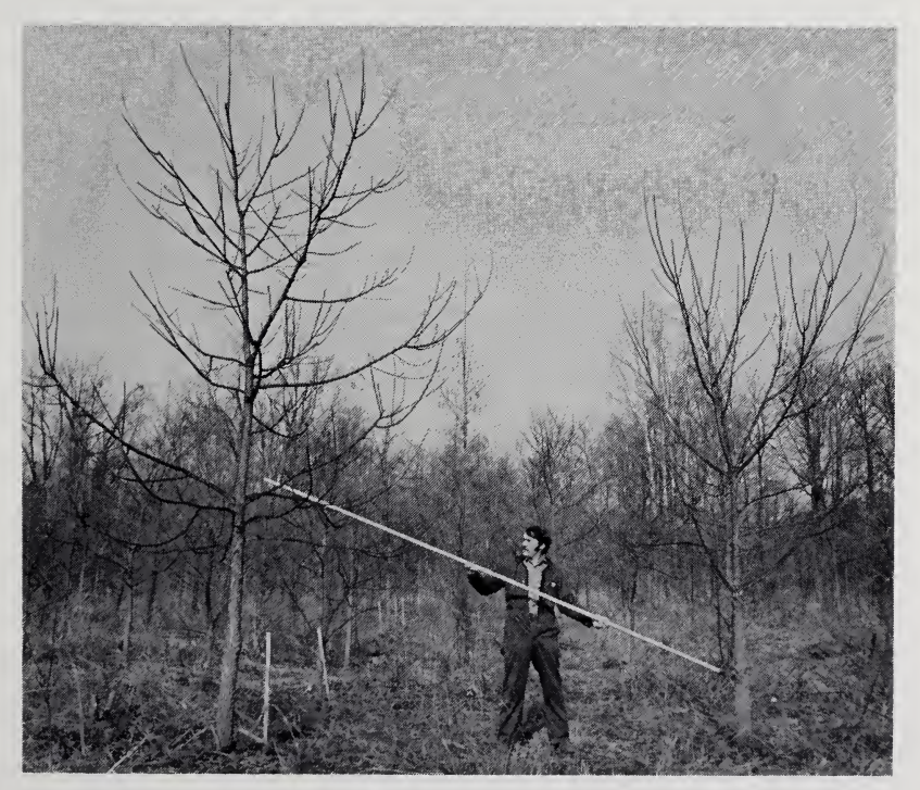
FIGURE 2. Trees of Tennessee origin (on left) were taller than those from Iowa (on right) at age 7.

The local southern Indiana source (1701) had considerable root rot at planting time, possibly accounting for its low survival and poor