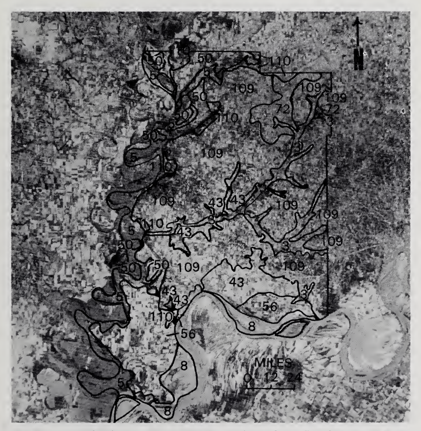
FIGURE 4. General soil map of Posey County superimposed on ERTS imagery: 3, Wakeland-Stendal-Haymond-Bartle; 5, Haymond-Nolin-Petrolia; 8, Huntington-Lindside; 43, Patton-Henshaw; 50, Vincennes-Zipp-Ross; 56, Weinbach-Seiotovile; 72, Reesville-Ragsdale; 109, Alford-Hosmer; 110, Bloomfield-Princeton-Ayrshire.

There are also some separations on the ERTS imagery which are not shown on the soil association map. The unit labeled U in Figure 3 is not clearly related to any feature. The line labeled G is similar to the limit of glaciation reported by Wayne (5).