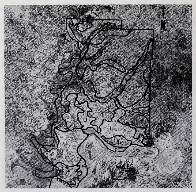
FIGURE 3. ERTS imagery of Poscy County showing the boundaries drawn as photo interpretation F, floodplain; T, terrace; L, lake deposit; G, glacial boundary and U, unknown,

Interpretation of the ERTS imagery did not consistently show the location of the soils formed in lacustrine sediments of former lake beds. In two areas these lacustrine soils were separated on ERTS imagery labeled L in Figure 1. One of the areas is greatly enlarged and the other is partially included with floodplain and terrace units.