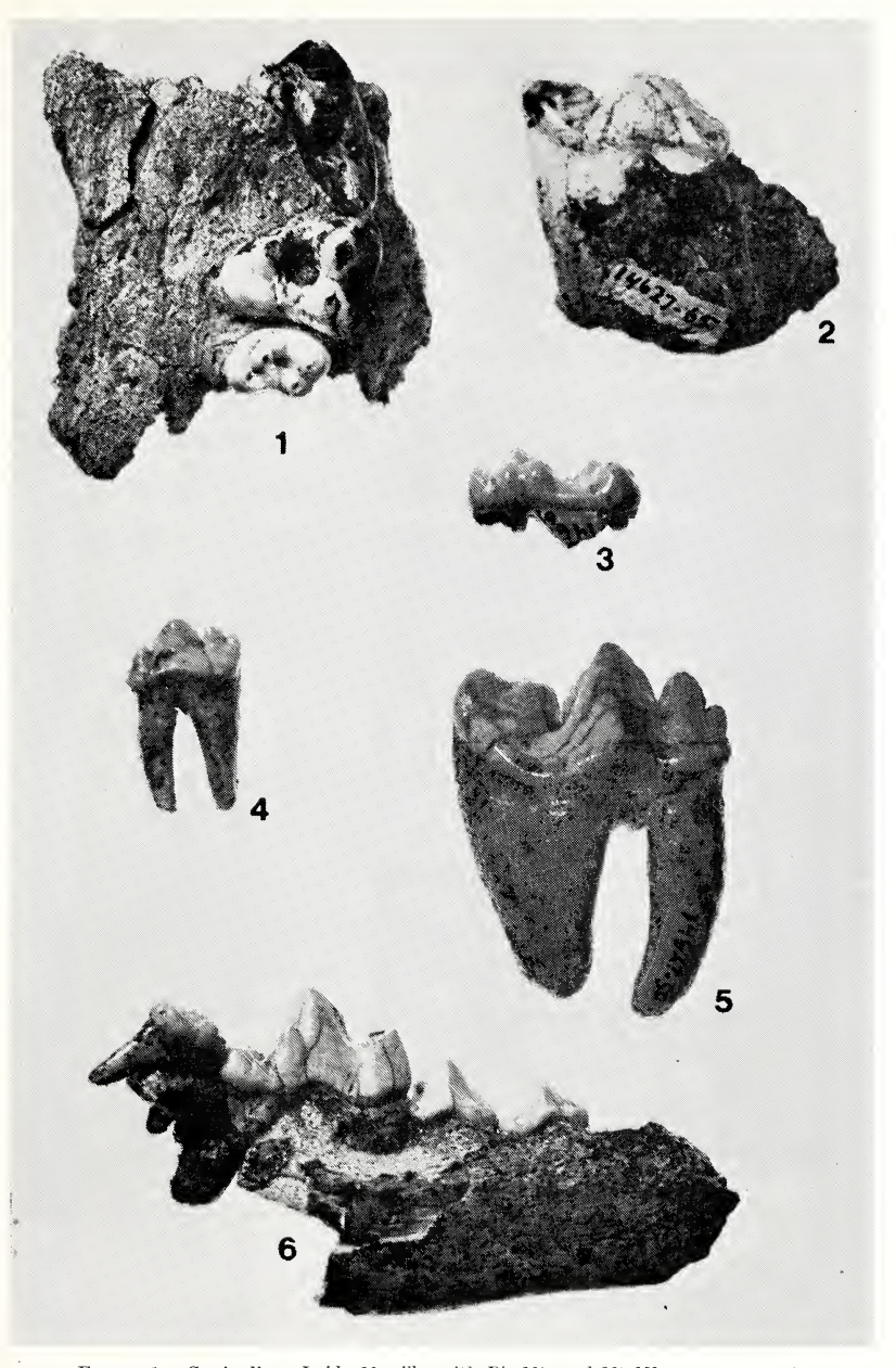
FIGURE 1. Canis dirus Leidy Maxilla with P^4 , M^4 , and M^2 IU 14627-88 × 2/3 FIGURE 2. Canis lupus Linne P^4 IU 14627-65 × 1 FIGURE 3. Ursus americanus Pallas M_1 IU 14627-64 × 1 FIGURE 4. Smilodon fatalis (Leidy) P^3 IU 14627-54 × 1 ° FIGURE 5. Smilodon fatalis (Leidy) P^4 IU 14627-50 × 1

FIGURE 6. Can is dirus Leidy Mandible with P_3 , P_4 , M_1 and M_2 IU 14627-69 \times 2/3