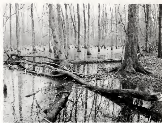
Figure 2.—Habitat of the mole salamander ( Ambystoma talpoideum ) in Posey County, Indiana.

Three voucher specimens were collected from the study site. An adult male and an adult female were deposited in the Field Museum of Natural History, Chicago, Illinois.