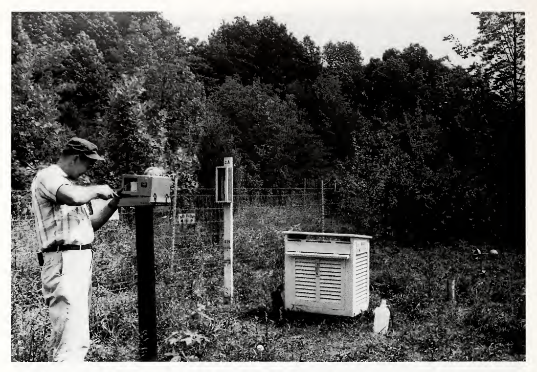
Figure 6.—Microclimatic field station with instrumentation in woody old field at Allee Woods, Parke County, Indiana (Spring 1963).

and beautiful volume which can only bring more admiration for his writing skills.