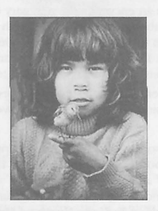
ILLUSTRATION 2. Navajo Child

The tribes' relationship with the Bureau is often described as a love-hate relationship. On the one hand, the Bureau is the symbol of the tribes' special relationship with the federal government. On the other hand, tribes have suffered from mismanagement, paternalism, and neglect. It is the hope and objective of many tribal peoples and government officials that tribes can enter