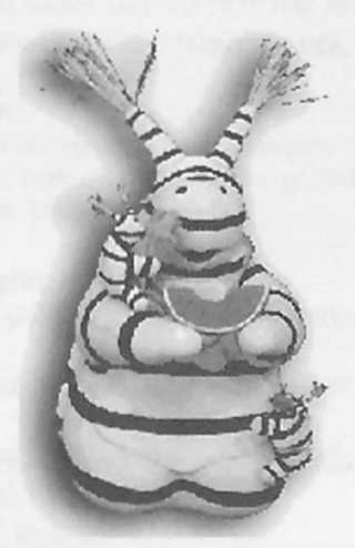
ILLUSTRATION 1. The Hopi Koyala (Koshari) are considered to be Clown Kachinas. They behave in the manner of Pueblo clowns, engaging in loud conversation, inappropriate actions and of course, gluttony. They are often drummers for the dances.

American Indians are different in their relationship with the federal government than other minority groups, in that their tribal governments have a formal relationship with the U.S. Government set forth in the Constitution, treaties, statutes and various court decisions. No other ethnic group in this country has this relationship. Interaction between federally recognized tribes and the federal government is that of a government-to-government relationship and, by treaty, the United States agrees to provide certain benefits to tribal groups.<sup>2</sup> Historically this relationship has generated many federal documents and continues to do so.