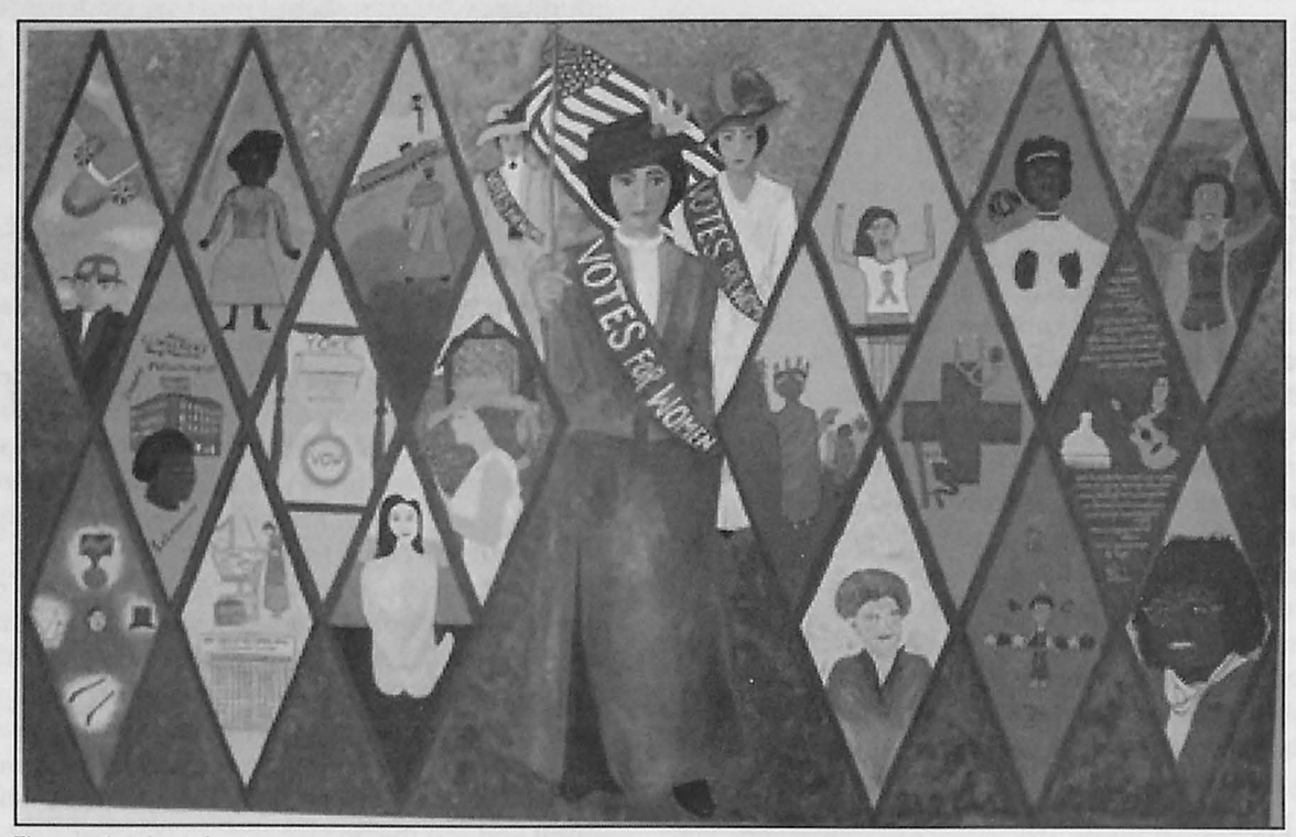
The completed mural.

UCLA Institute on Primary Resources: What are Primary Resources? Webpage. 26 February 2006 < http://ipr.ues.gseis.ucla.edu/info/definition.html>.