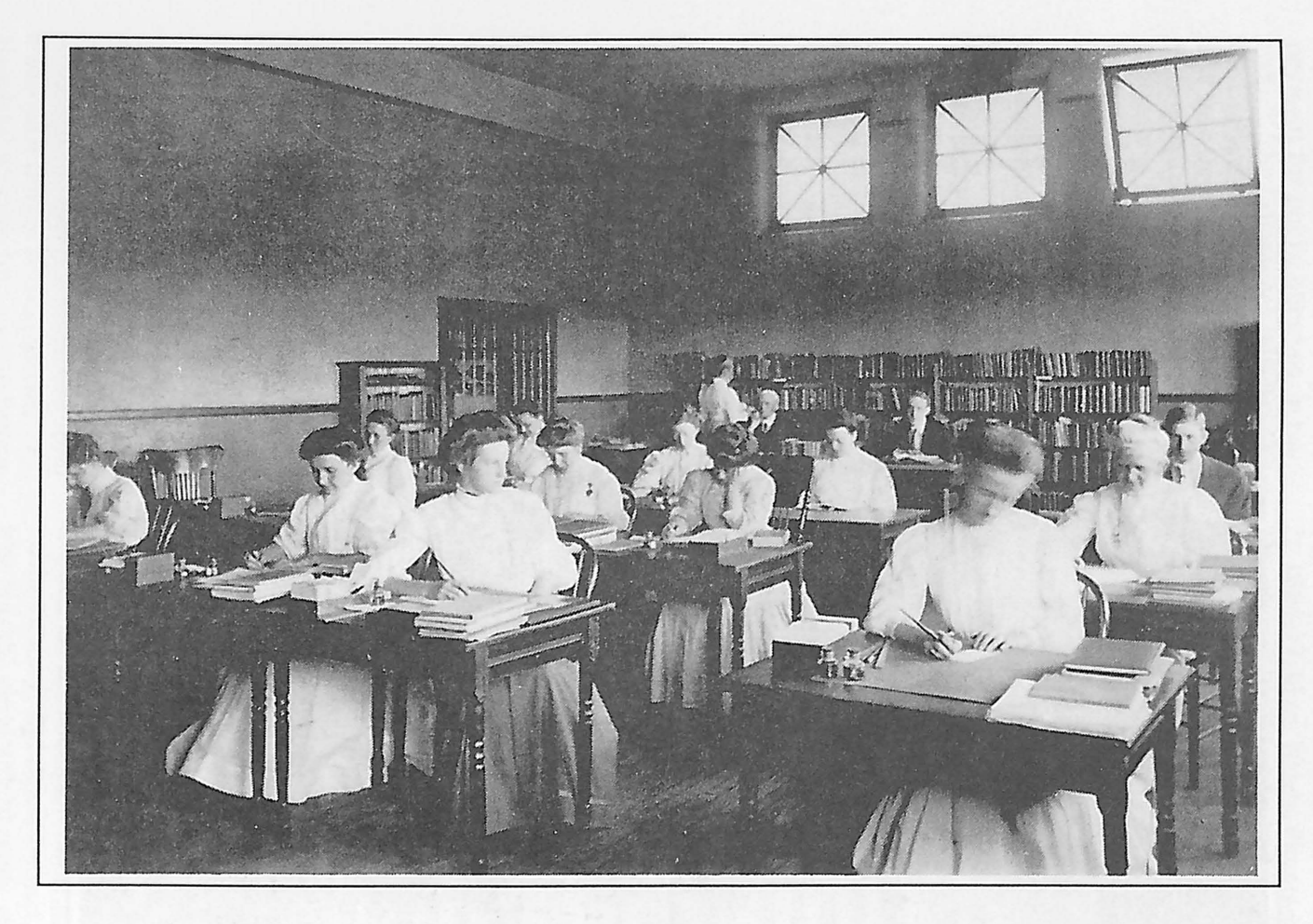
The Public Library Commission's Summer School for Librarians at Winona Lake in 1907.