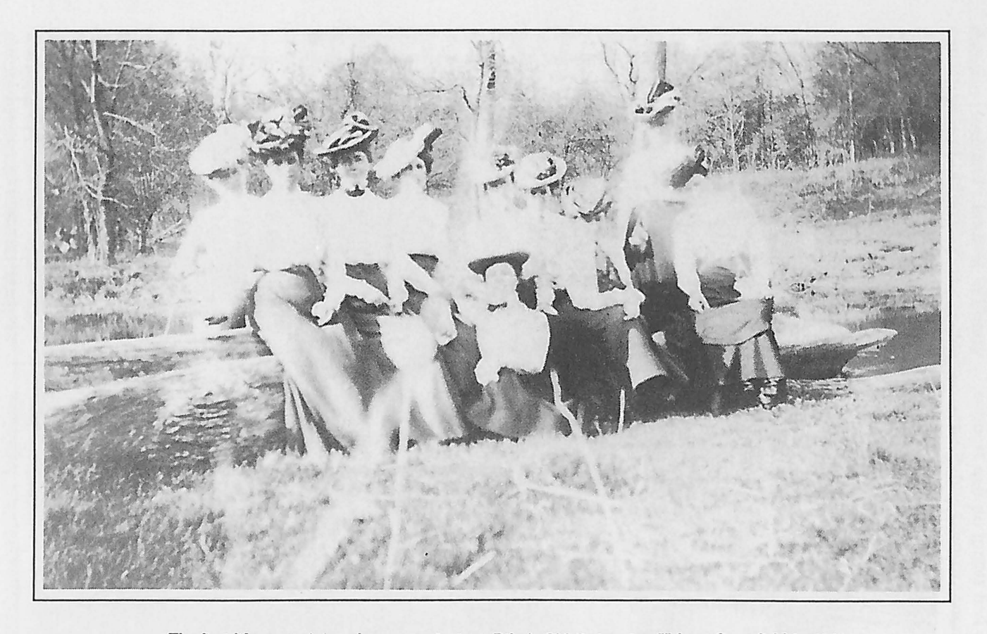
The first library training class on a picnic at Riley's Old Swimming Hole at Greenfield in 1901. Merica Hoagland is second from left.