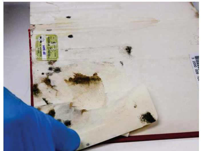
Another was under the circulation pocket.