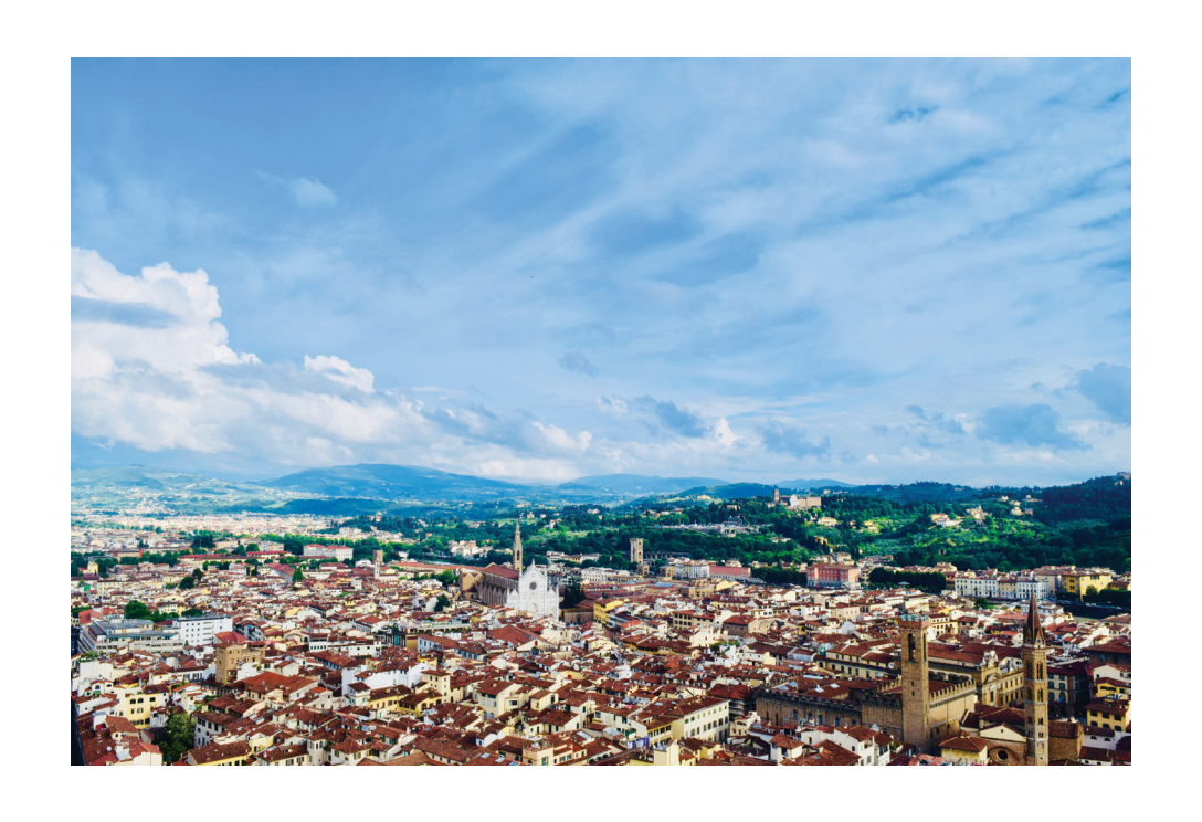
Ciao bella Kylie Dennis Photography