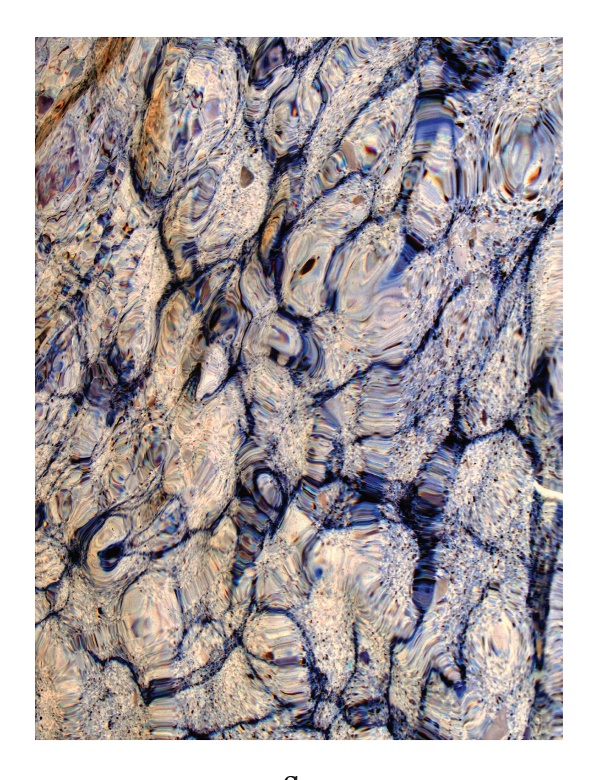
reflect Olivia Van Renterghem Photography, 6" x 8"