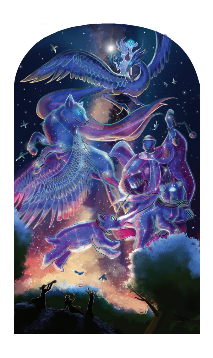
Gods of the Light