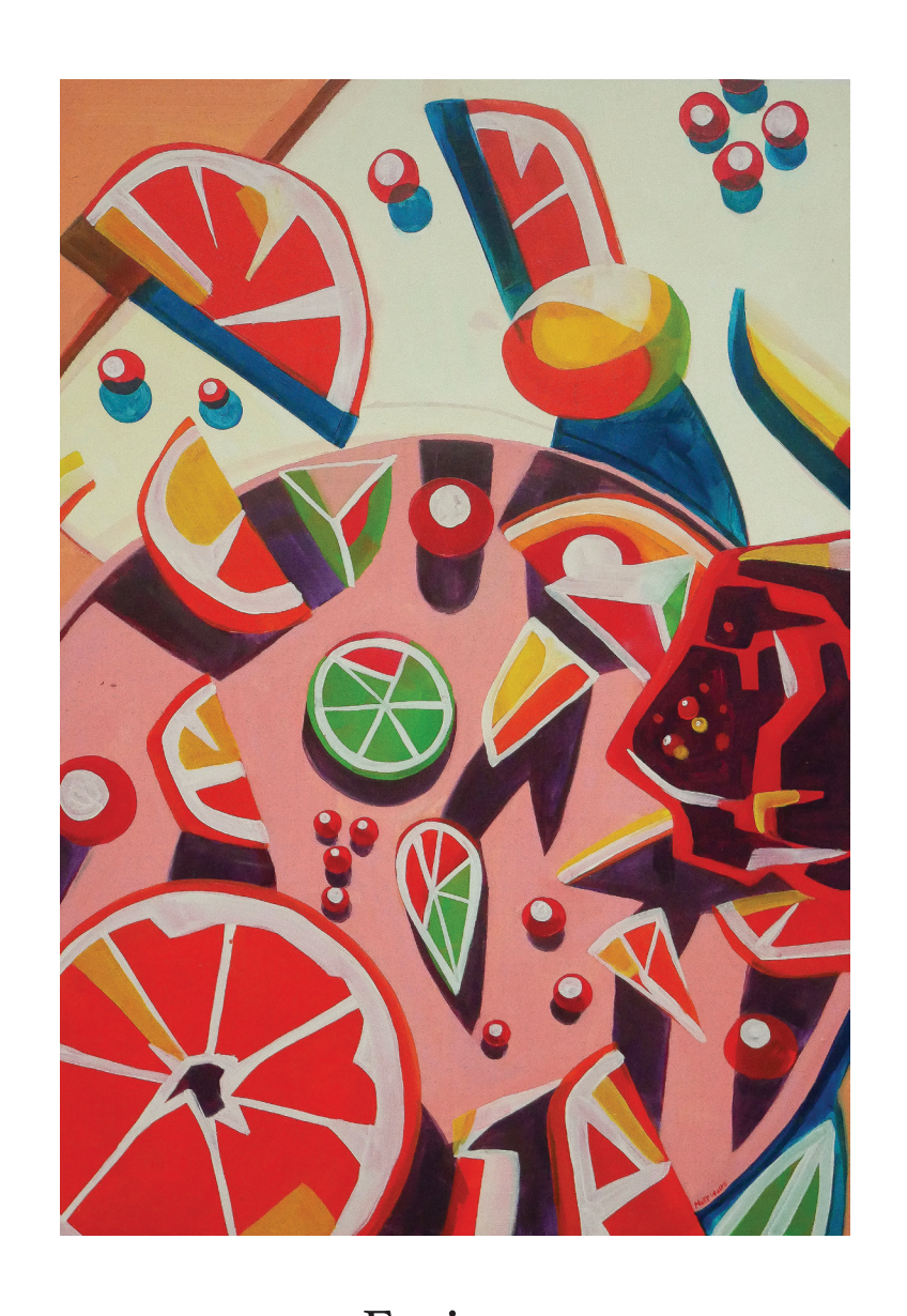
Fruit #4 Molly Wolfe Oil on Panel, 30" x 22"