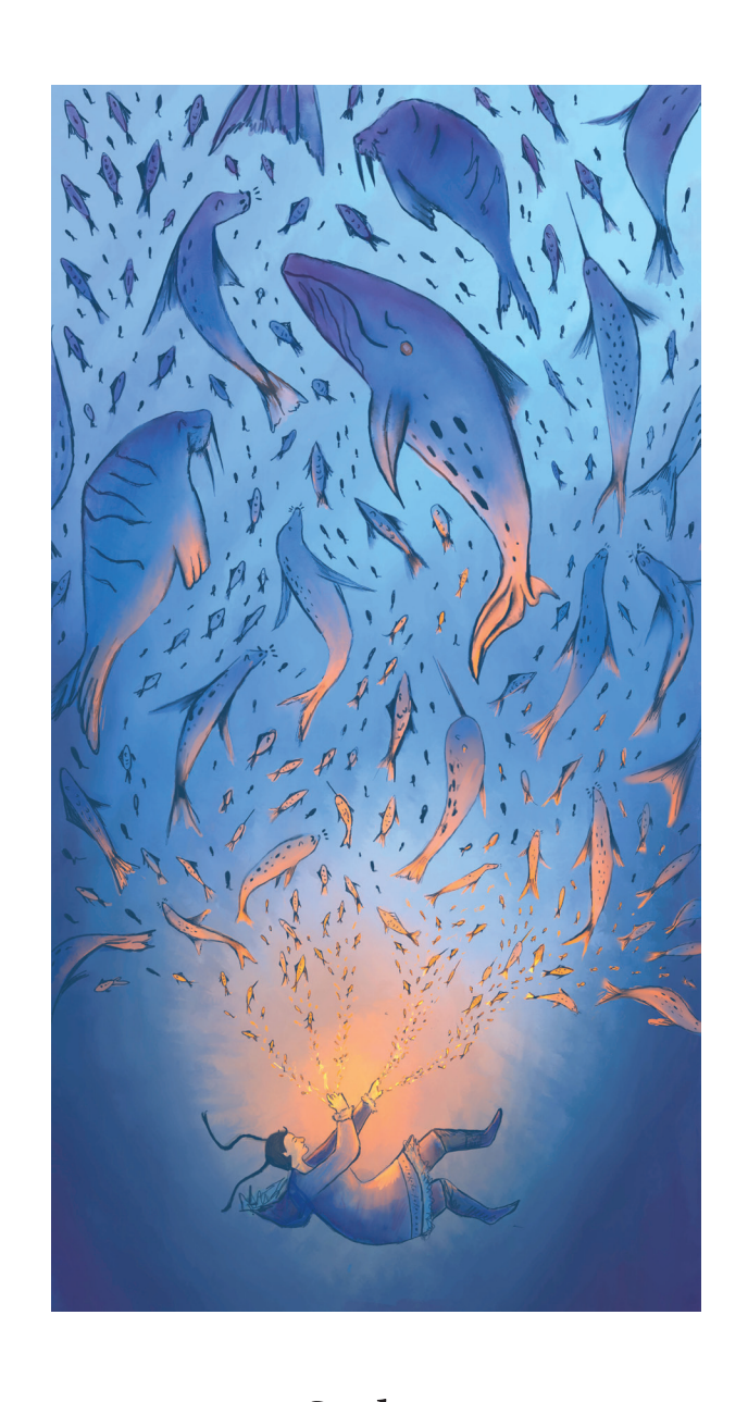
Sedna Molly Wolfe Digital Art, 9" x 17"