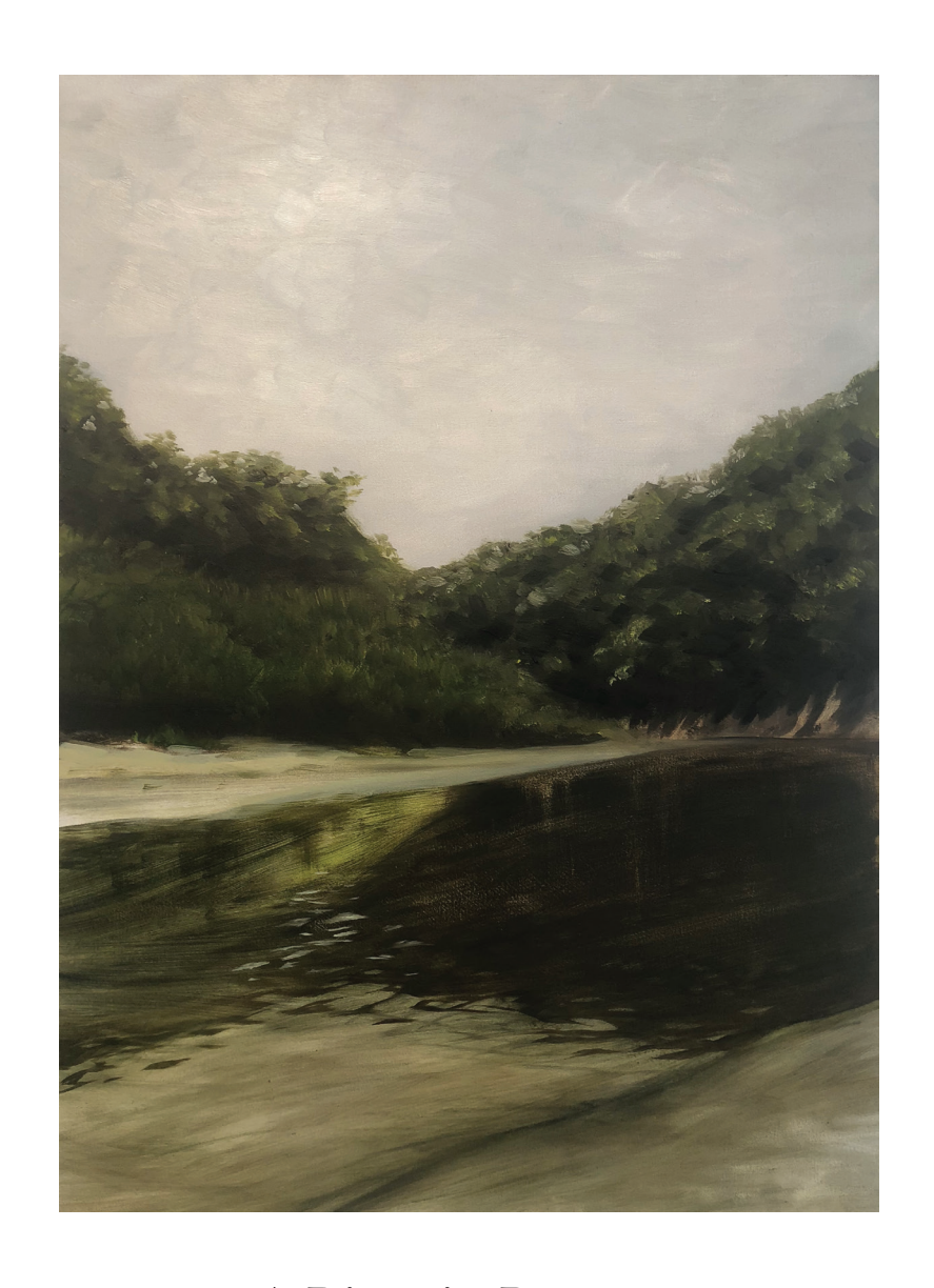
A River in Panama Mailinh Ho Oil on Canvas, 15.25" x 21"