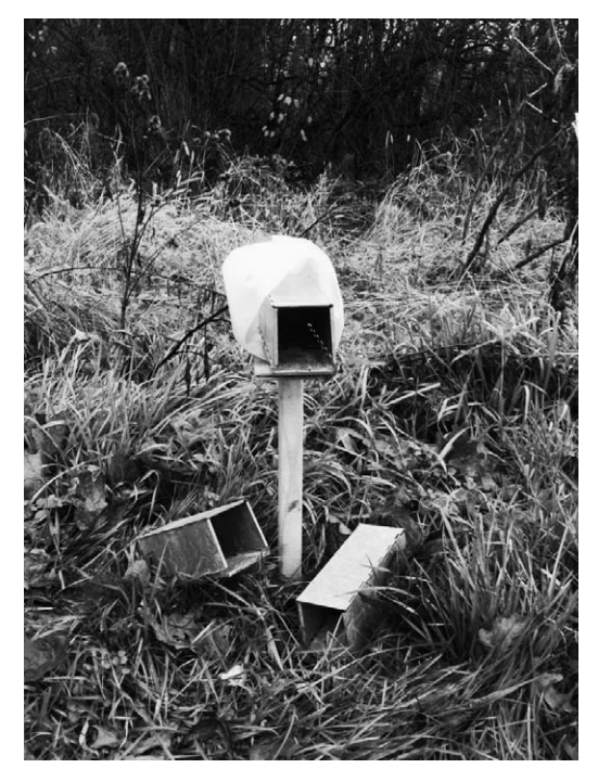
Figure 2.—A typical trapping station set up with three Sherman traps in different positions, ground, semi-elevated, and elevated.

trap was placed against the stake at a 45^{\circ} angle with the door opening upwards. The third trap was placed on the ground at the base of the wooden stake (Fig. 2).