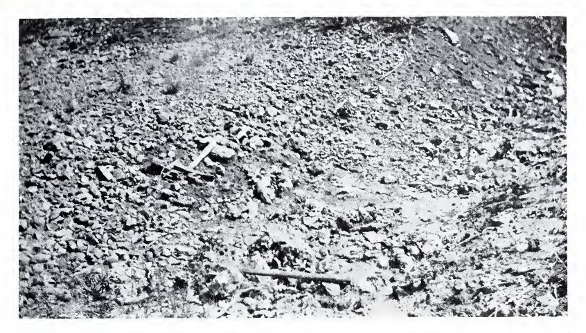
Fig. 1. Residuum of chert and geodes left from the decomposition of the basal Harrodsburg limestone.

known as the "Riverside sandstone," but was renamed "Edwardsville" by Stockdale.<sup>3</sup> The upper portion is usually a succession of fine-grained sandstone and siltstone beds, with shaly partings. Some of the sandstones form prominently resisting ledges. One of these called by Stockdale the Mt. Ebel sandstone member, proved to be of considerable value in determining structural conditions where outcrops of the Harrodsburg were absent. It is of a dark yellow color, often mottled by iron streaks and ranges from one to five feet in thickness. It occurs between five and