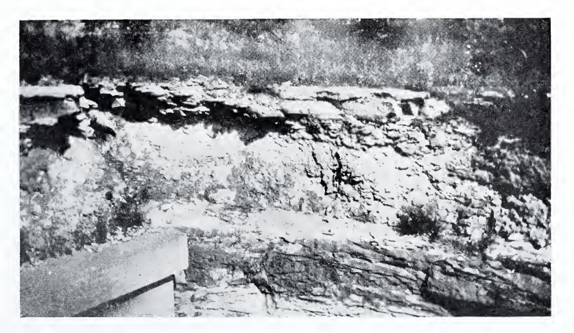
Fig. 2. Contact of the Harrodsburg and Borden at the west end of the Illinois Central railroad tunnel. The limestone is underlain by the basal chert and geode layer. The top of the Borden (Edwardsville formation) is at the level of the top of the concrete.

known as the "Riverside sandstone," but was renamed "Edwardsville" by Stockdale.<sup>3</sup> The upper portion is usually a succession of fine-grained sandstone and siltstone beds, with shaly partings. Some of the sandstones form prominently resisting ledges. One of these called by Stockdale the Mt. Ebel sandstone member, proved to be of considerable value in determining structural conditions where outcrops of the Harrodsburg were absent. It is of a dark yellow color, often mottled by iron streaks and ranges from one to five feet in thickness. It occurs between five and