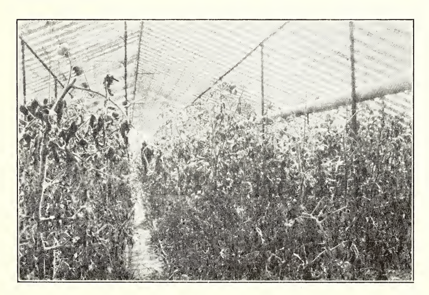
Fig. 2—Leaf mold destroys every leaf on the plant and gives the appearance of the plants having been swept by fire.

Proper ventilation of the houses has proven to be an important factor in controlling this disease. It would seem, then, that the prevention of leaf mold is largely a matter of greenhouse management and the disease would probably be worse in the poorly managed houses. This, however, is not true, since leaf mold is a serious pest in certain of the best greenhouses in the state. And in some of the conspicuously poorer houses it seldom if ever occurs. There is no question that improper ventilation and the consequent accumulation of moisture is a factor in increasing the disease, but it is equally certain that continual appearance of the disease and the concomitant accumulation of inoculum plays an important part.