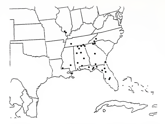
Figure 5.—An example of southeastern distribution pattern. The species shown is Dolichognatha pentagona (Hentz) (Tetragnathidae).

that extends into the southern part of the state (DeCosta 1964; Ross 1944; Smith 1961). Ranges of these species may extend in a narrow coastal strip to southern New England under the moderating influence of the Atlantic.