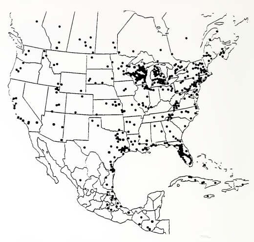
Figure 6.—An example of a distribution pattern where the species is found throughout the United States. The species shown is Neoscona arabesca (Walckenaer) (Araneidae).

Seventeen largely synanthropic species are regarded as introduced, primarily from Europe. The only Illinois-Indiana species of the families Dysderidae, Oecobiidae, Pholcidae and Scytodidae are among these. Thirty-five species are so poorly known that their ranges