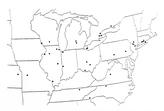
Figure 4.—An example of a northeastern distribution pattern. The species shown is Sphodros niger (Hentz) (Atypidae).

The second largest group of species (18.4%) has a northeastern distribution, the southern limit of which varies but often lies about at the latitude of North Carolina, somewhat further south than the southern tip of Illinois (Fig. 4). Northern species, reaching their southern limit in northern or central Illinois, compose 15.9% of the fauna, southeastern species 13.6%. Southeastern species are often at or near their northwestern range limit in the southern tip of Illinois (Fig. 5). This sort of distribution is well known for a number of other groups of organisms found, in Illinois, chiefly in the small area of Gulf Coastal Plain