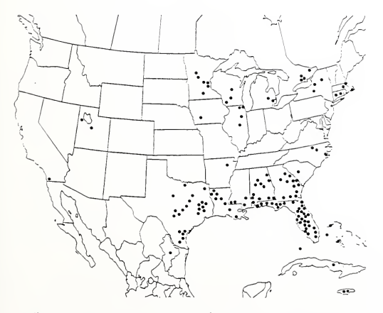
Figure 2.—An example of an eastern distribution pattern, with disjunct populations in western mountains. This is Mimetus notius Chamberlin (Mimetidae).

(desiccation rate may be more important than humidity itself). The disjunct ranges of some species may have several causes: survival in refugia, recent introductions, failure to recognize separate populations as different species, lack of collecting in intervening areas or, rarely, incorrect locality labels. The presence of disjunct populations of eastern species in western mountains is frequent (Fig. 2), and consistent with the hypothesis that they originally had a wider distribution, which became restricted as a result of climatic changes. Oth-