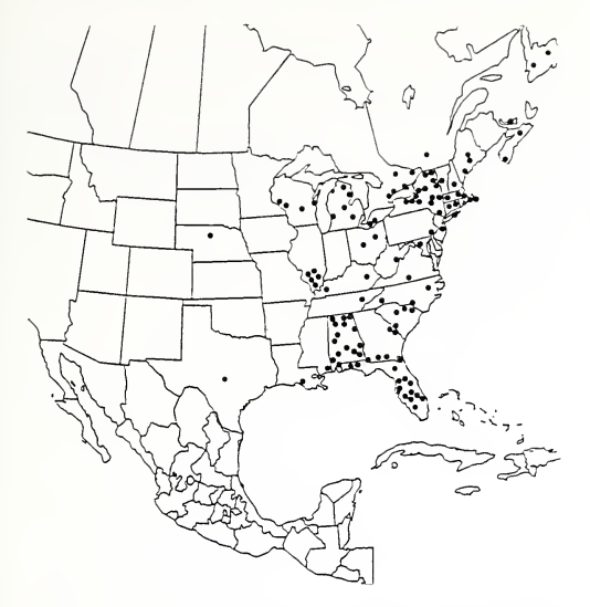
Figure 1.—An example of an eastern distribution pattern. This is Theridion glaucescens Becker (Theridiidae).

(desiccation rate may be more important than humidity itself). The disjunct ranges of some species may have several causes: survival in refugia, recent introductions, failure to recognize separate populations as different species, lack of collecting in intervening areas or, rarely, incorrect locality labels. The presence of disjunct populations of eastern species in western mountains is frequent (Fig. 2), and consistent with the hypothesis that they originally had a wider distribution, which became restricted as a result of climatic changes. Oth-