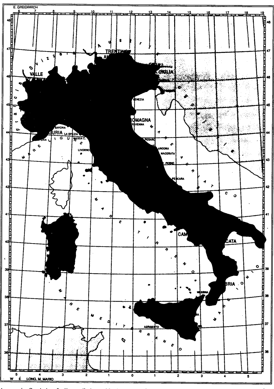
The Republic of Italy

Annuario Statistico Italiano (Istituto Nazionale de Statistica 1992)