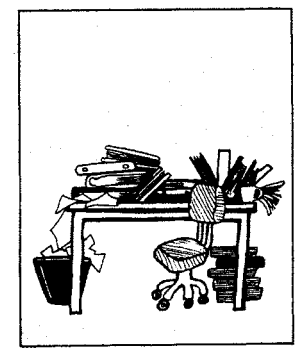
WANTED: Librarian . . . . Again