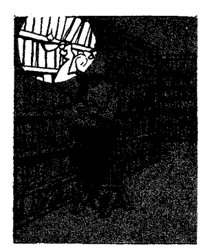
If you are a curator, librarian, teacher, scholar or researcher in fine arts, this is your SINE QUA NON

You can lay your finger on 2,000 art collections in the U.S. and Canada, and find everything from special collections to hours of opening, visual resources to publishing.