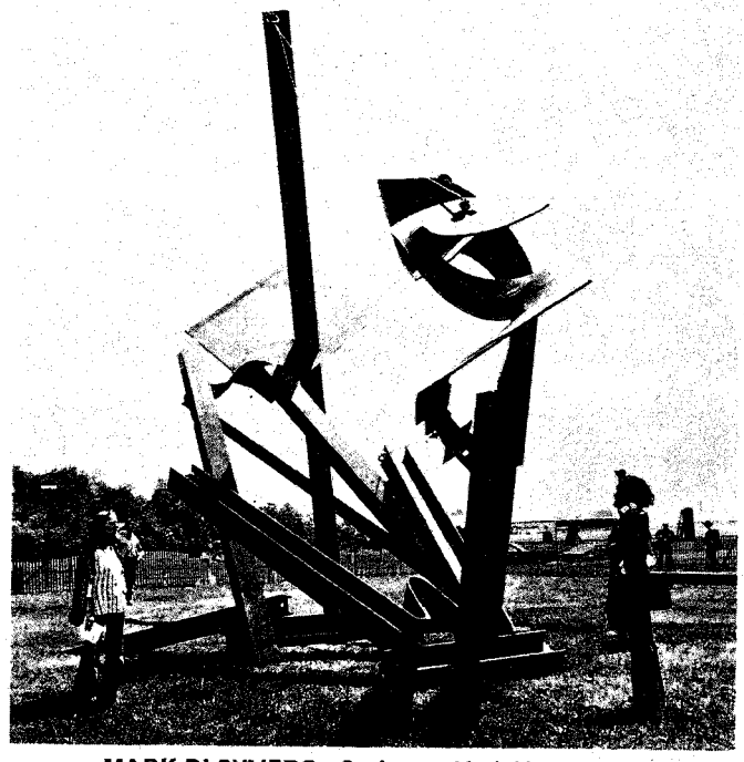
MARK DI SUVERO: Sculpture, York University

The result was an unqualified success. Generous funding made it possible to invite outstanding panelists; registration exceeded anyone's anticipation and late registrants had to be turned away. In addition to the 1500 delegates from the U.S. and Canada, some 200 sculptors came from 35 countries. Delegates included students, teachers, practising sculptors, curators, critics, dealers, collectors, arts administrators, planners and fabricators. Panels and talks covered theories and principles, aesthetics, thematic and practical concerns, while workshops covered every imaginable aspect of current practice. Outstanding among these was Mark di Suvero's demonstration/workshop, The crane as a tool. Working in a large field opposite the Anthony Caro sculpture park, behind the Fine Arts building, di Suvero and helpers constructed in three days a large scale permanent piece. The idea to provide this opportunity to watch a work in progress showed genuine